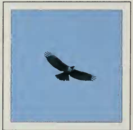
Plate 2. Adult Rufous-bellied Eagle Hieraaetus kienerii in flight.