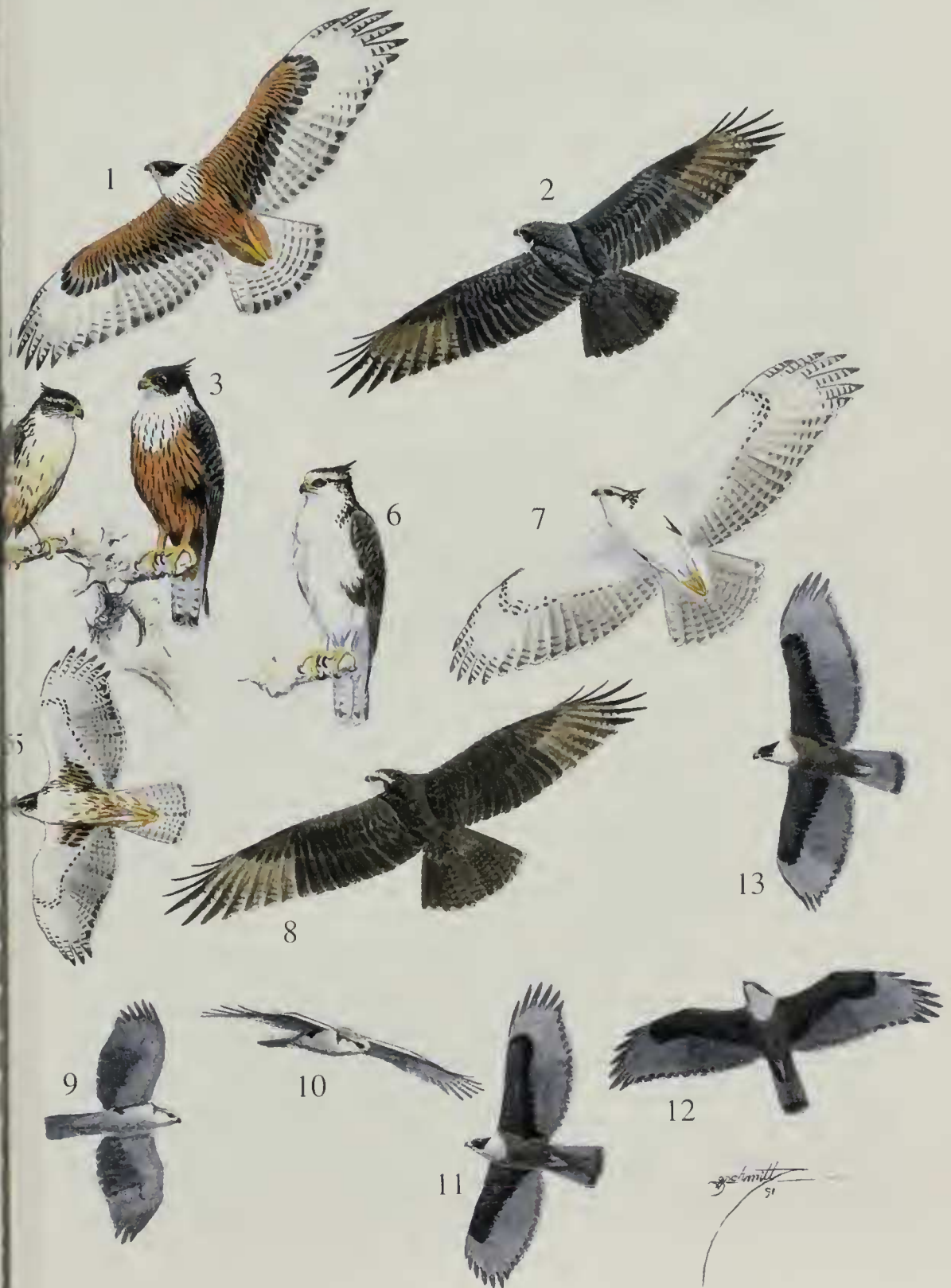
Plate 4. Rufous-bellied Eagles Hieraaetus kienerii . N. J. Schmitt 1 - 3 adults, 4 - 5 transitional, 6 - 10 juveniles, 11 - 13 adults.