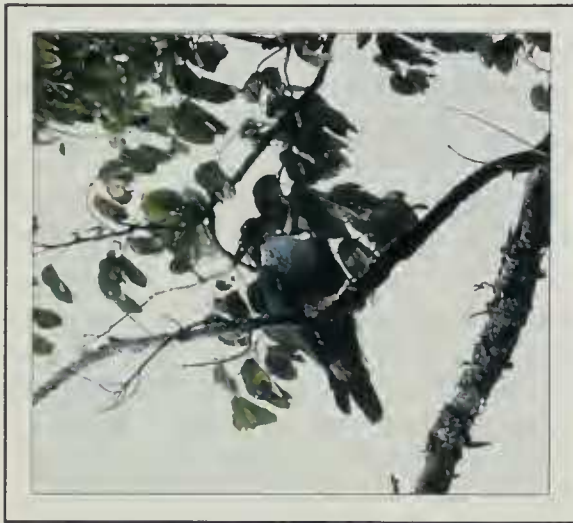
Plate 1. Adult Rufous-bellied Eagle Hieraaetus kienerii .